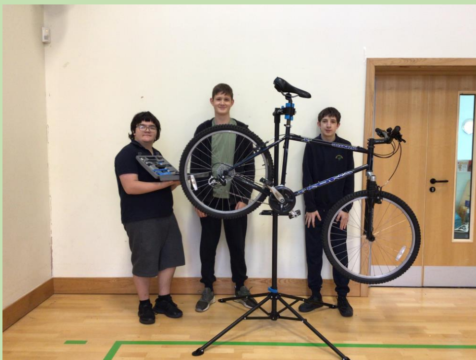
Friends of Heart of the Forest presenting Goshawk with a bike and stand that was recently purchased for use by the Duke of Edinburgh group who are learning bike maintenance.